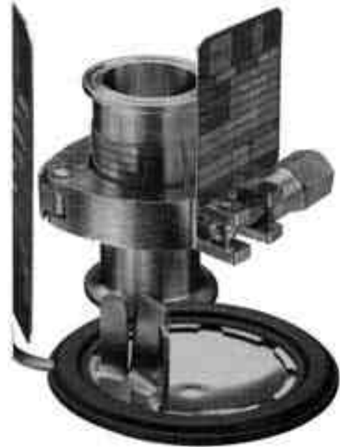
Worldwide patents pending

Do not locate the disk where it may be subjected to thermal shock. Moisture, rain, condensation or snow may cause a thermal shock to the disk causing the disk to burst below its marked Burst Pressure. A protector is recommended for temperature above 212°F (100°C), consult BS&B Safety Systems, Inc or BS&B Safety Systems Ltd.