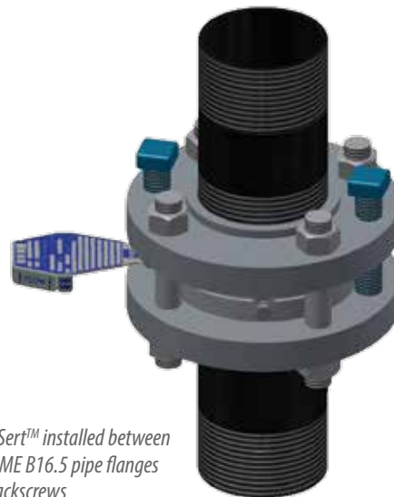
FA-7R Quik-Sert™ installed between two ANSI ASME B16.5 pipe flanges fitted with jackscrews