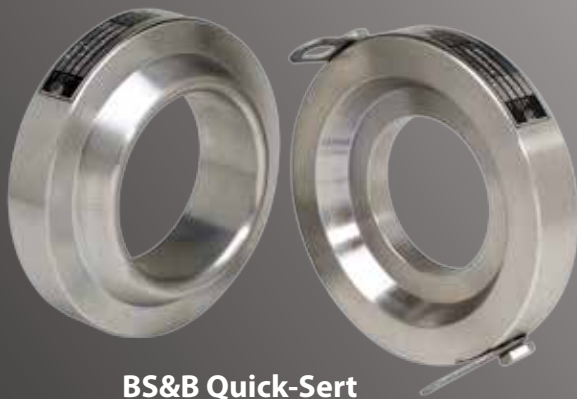
BS&B Quick-Sert Safety Head