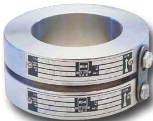
BS&B FA-7R Quik-Sert safety head - flanges are assembled with side mounted pre-assembly in sizes through 8 inch (200 mm) with recessed cap screws in 10 inch (250 mm) nominal size and up

Standard materials for bolted type safety heads are carbon steel, 304 and 316 stainless steel. Special materials include Monel®, nickel, Hastelloy® B and C, aluminum, brass and other types of stainless steel. Glass-lined base and plastic-coated are also available.